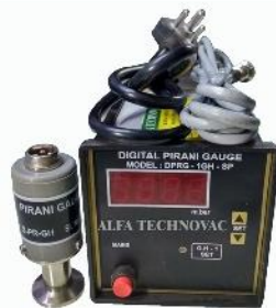
DIGITAL PIRANI GAUGE