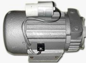
CARBON VANE DRY VACUUM PUMP