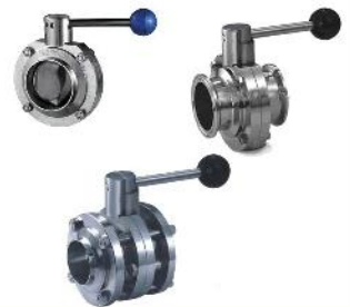
HIGH VACUUM BUTTERFLY VALVE