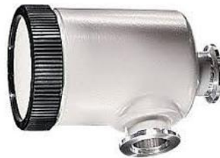
INLET FORELINE TRAP