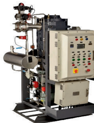
Chemical Dry Vacuum Pumping System DP-300