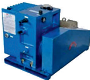
Belt Drive Vacuum Pump CD Series 90 & 120 m3/Hr