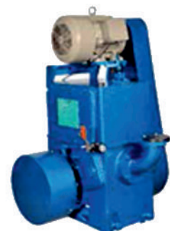
Single Stage Rotary Piston Pump CP 250 Capacity - 250 m3/Hr

Authorised Sales & Service Distributor for