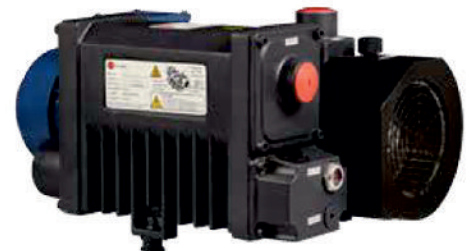
Single Stage Oil Lubricated Vacuum Pump SP Series Capacity 16,40,65,100,200,300 m3/Hr