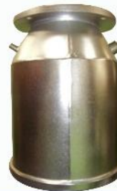
LIQUID NITROGEN TRAP