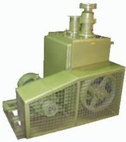
BELT DRIVEN VACUUM PUMP