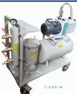
PORTABLE VACUUM SYSTEM