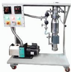
DIFFUSION PUMPING SYSTEM