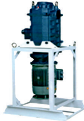
Dry Multistage Claw vacuum Pump DP Series 300 m3/Hr