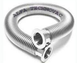
FLEXIBLE SS BELLOW