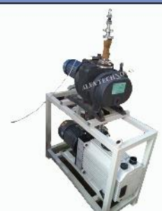
ROOTS ROTARY VACUUM SYSTEM