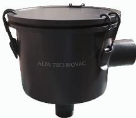
INLET DUST FILTER