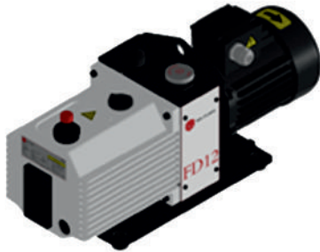
Direct Drive Two Stage Vacuum Pump FD Series Capacity : 6,12,20,60 m3/Hr

www.alfavacuum.com technovacsales@gmail.com