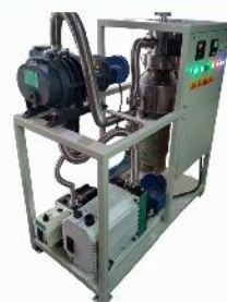
HIGH VACUUM PUMPING SYSTEM