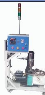
AC & R EVACUATION CART