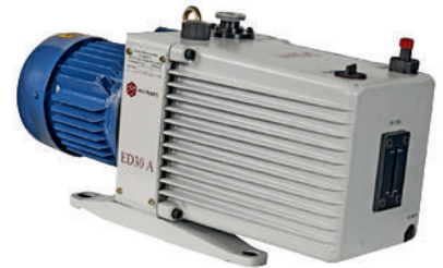
Direct Drive Two Stage Vacuum Pump ED Series Capacity : 30 m3/Hr