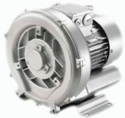
SIDE CHANNEL BLOWER