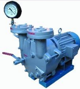
WATER RING VACUUM PUMP