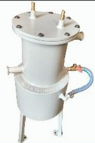
INLET CONDENSER TRAP