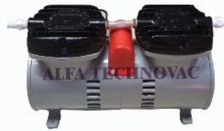
DIAPHRAGM VACUUM PUMP