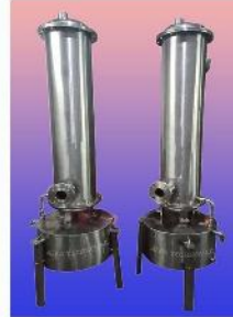
VERTICAL U-TUBE CONDENSER